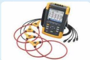
Power Quality Audit

Service Activities : CLARIANT is offering a comprehensive package quality solution for