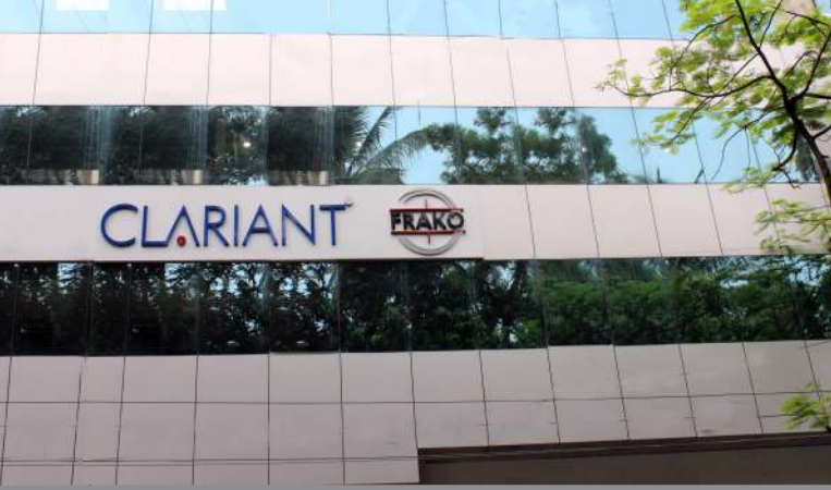
Clariant Corporate Office