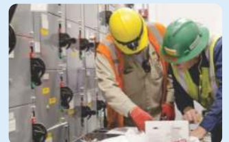
Annual Maintenance Contract